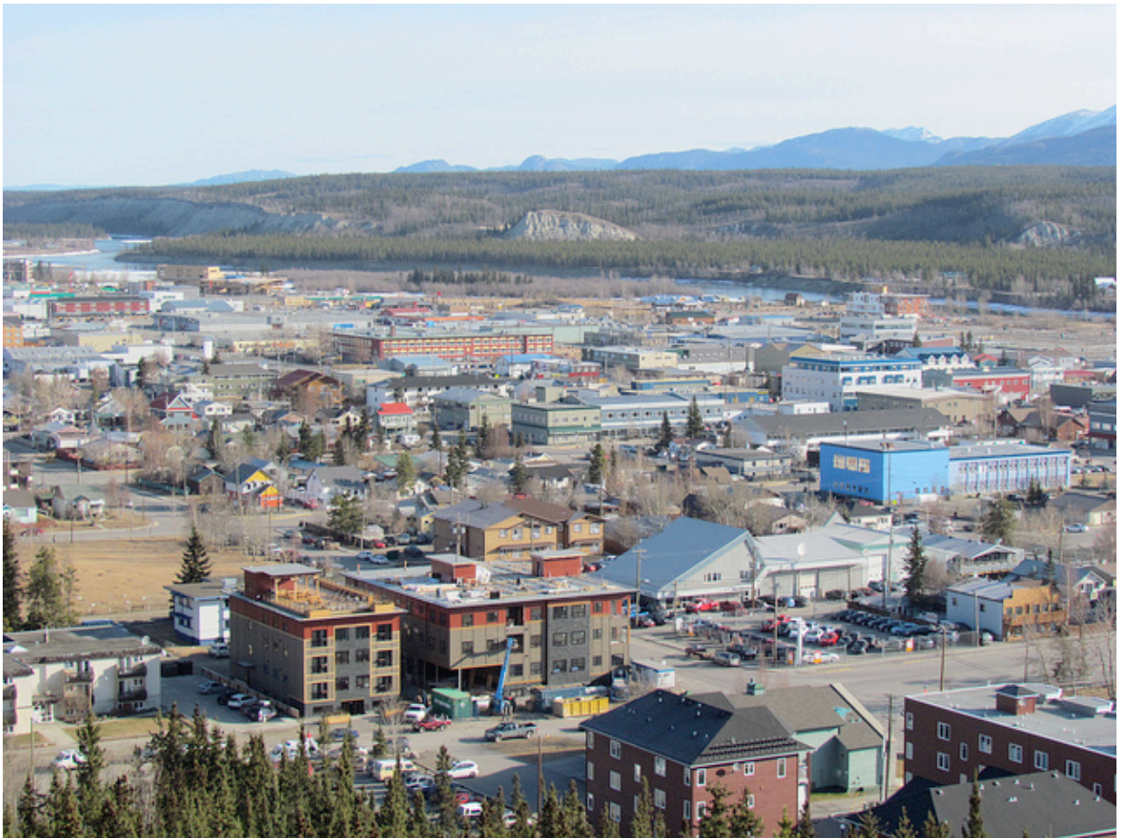
Figure 7: Downtown Whitehorse and the Yukon River