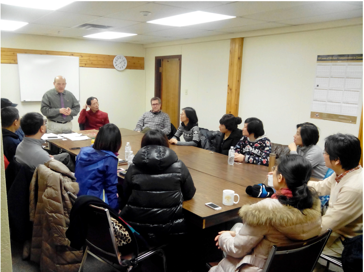
Figure 6: Whitehorse Chamber presenting to a group of Chinese Wholesale Tourism Operators with access to more than 100 million potential Chinese Tourists.