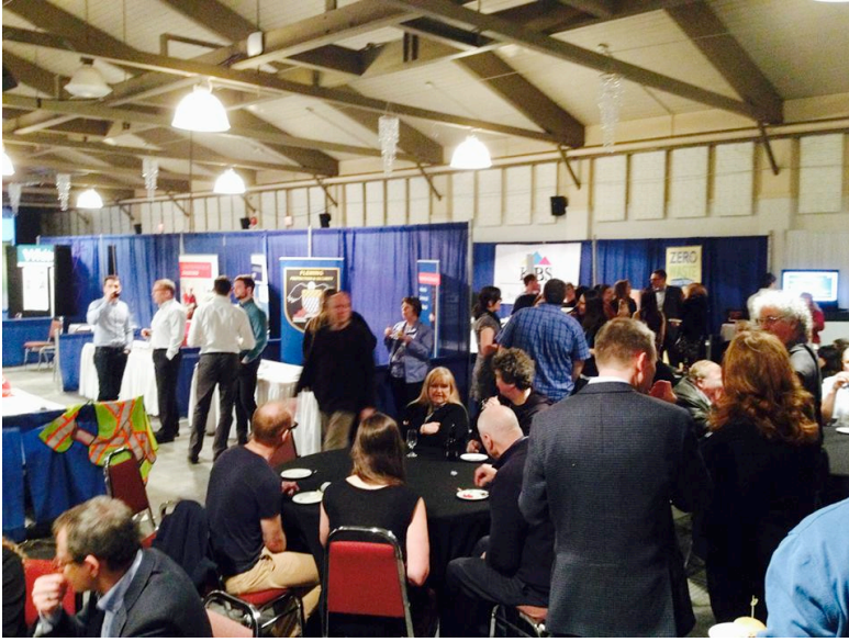
Figure 4: A few of the 34 booths at The Trade Show for the Business Connect Conference March 2015