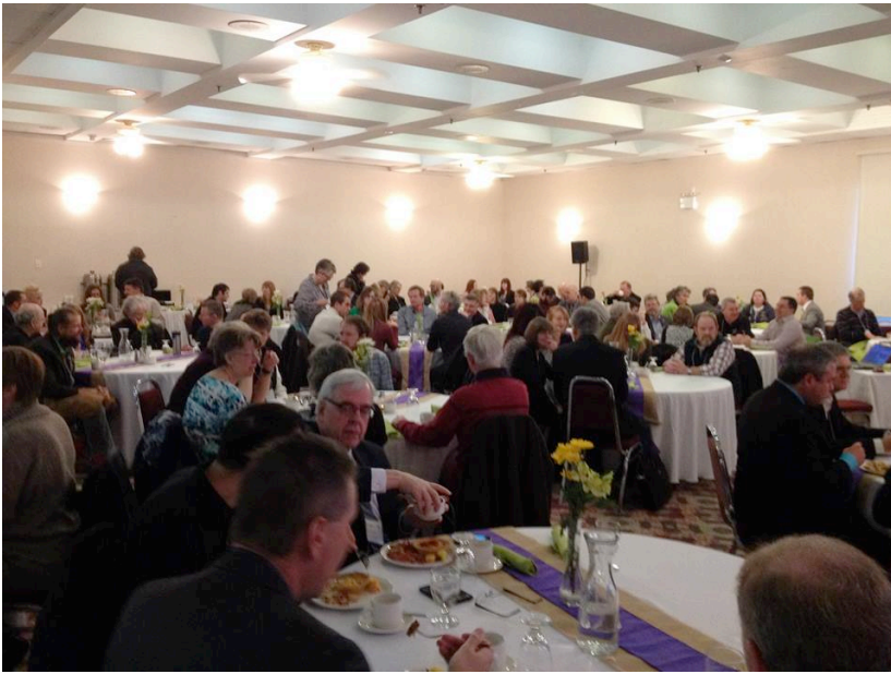
Figure 3: Part of the Lunch Crowd at our Business Connect Conference