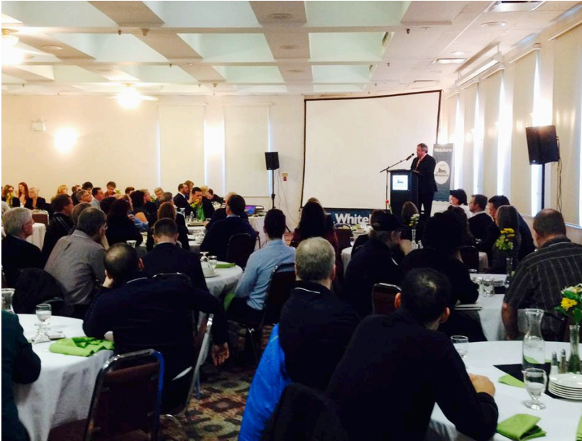
Figure 2: Mayor Dan Curtis addressing a Whitehorse Chamber Of Commerce audience