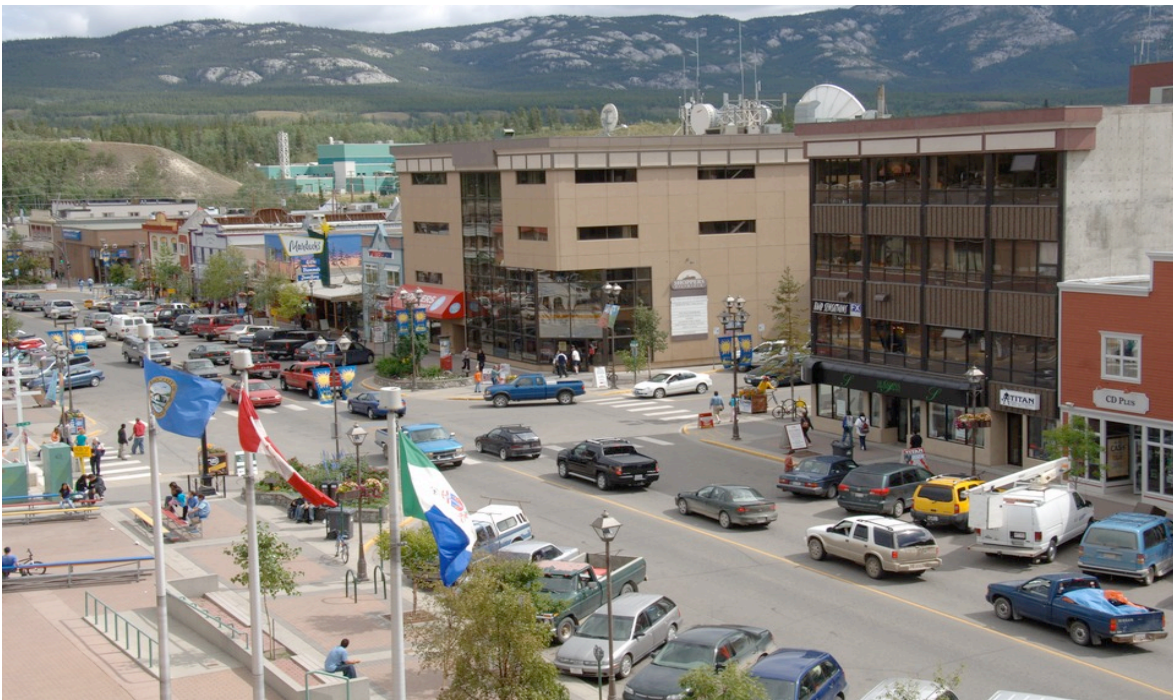
Figure 1 : Downtown Whitehorse